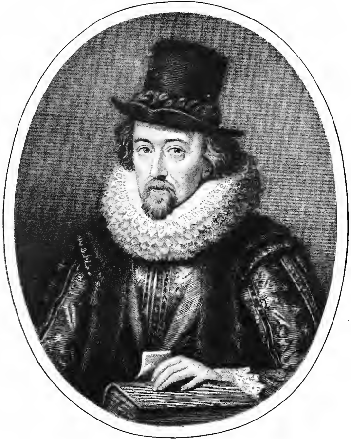
SIR FRANCIS BACON